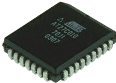
Figure 1. A memory chip (Taiwan Semiconductor Manufacturing Company, Limited, TSMC, Taiwan)