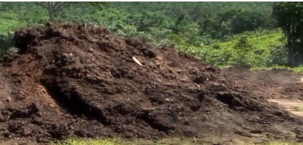
Photo 8: Seed cob residue after burning