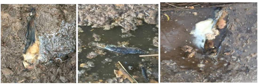
Photo 6: Decomposing fish near the palm factory located on the Baffia road

These photos corroborate the comments of our respondents by demonstrating the impact of oil milling activities on waterways and aquatic species.