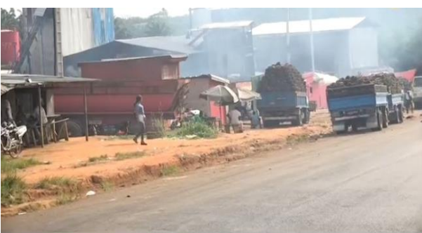
Photo 1: Trucks loaded with bunches of palm leaves parked at the entrance to the factory

These photos show us an oil palm processing factory installed between Mouyassué Maféré near the Kpalifouè river.