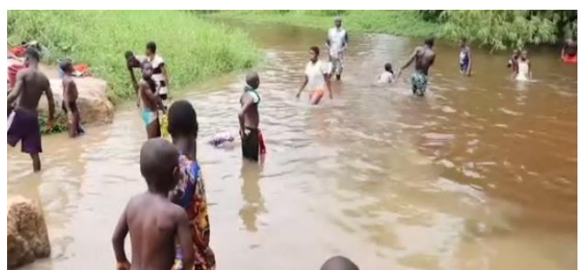
Photo 9: Children swimming in N'Gotokpré

Data from our field survey show that the activities of oil mills in the sub-prefecture of Maféré are responsible for the appearance of chronic diseases, itching, diarrhea as evidenced by the comments of this producer: « There are cases of illness for example there are others who start to cough, there are others who have itching, even I myself do not know if it is this water that I wash myself with. with it but I washed myself with it without realizing that it was polluting currently I have a side that burns me I don't know if it's the polluting water which is used in the factories which gave me this illness ». "oil palm producer maintenance". Another, the youth president, said this: « When we wash with water our body often itches and we also get little pimples, in any case the use of river water currently is not without consequences for all the residents who are nearby of this water ». "Interview president of the youth of Kokotilé Anvo". What his counterpart in Maféré seems to confirm: « The health of populations is threatened, the environment is polluted, there are collateral effects of exploitation so it is important that mitigation measures are take » "focus group community leaders from Maféré".