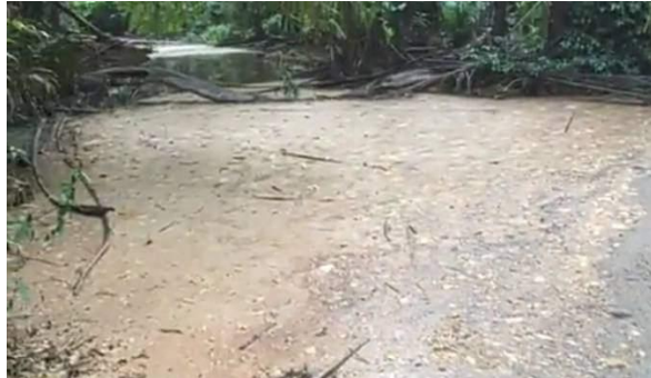
Photo 3: A view of the N'Gotokpré river invaded by oil residues