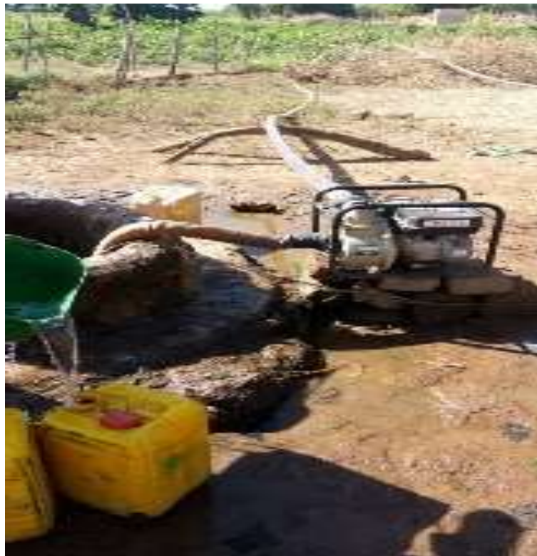
Photo 7: Pumped irrigation system at Dourou in the Nakambé watershed Shot: Koala, December 2020