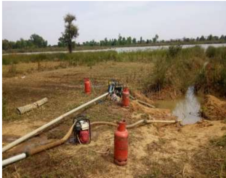
Photo 6: Pump irrigation system at Toécé in the Nakambé watershed Shot: Koala, December 2020