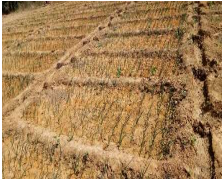
Photo 4: Earthen cages in the village of Rikiba in the Nakambé watershed