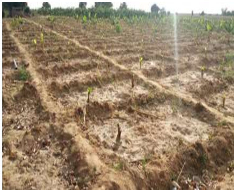
Photo 3: Earthen cages in the village of Rikiba in the Nakambé watershed

Dykes are strategies for conserving water in fields. They are small compacted earth structures used to form basins in which market garden produce and other products are grown (Photos 3 and 4).