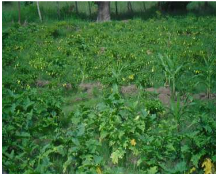
Photo 2: Combination of chilli, eggplant and maize in Tangaye village in Bam