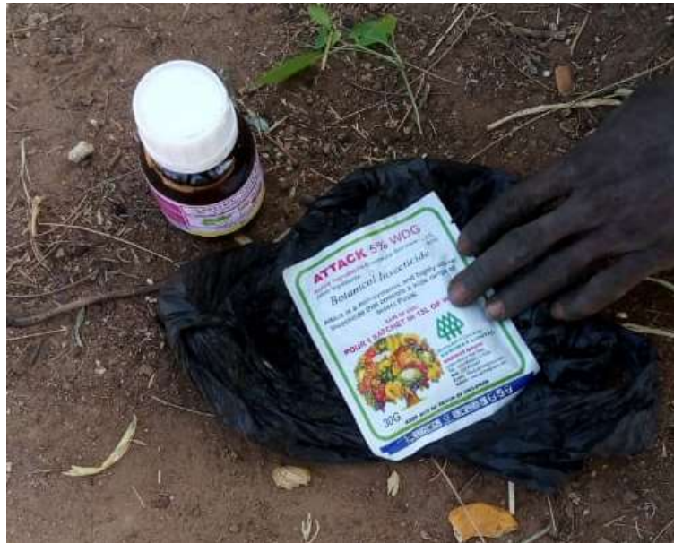
Photo 5: Types of pesticides used in the Nakambé watershed Shot: Koala, September 2021

growers surveyed use urea and organic fertilizers. The proliferation of weeds and heavy attacks on plants by pests have led to heavy use of pesticides (Photo 5).