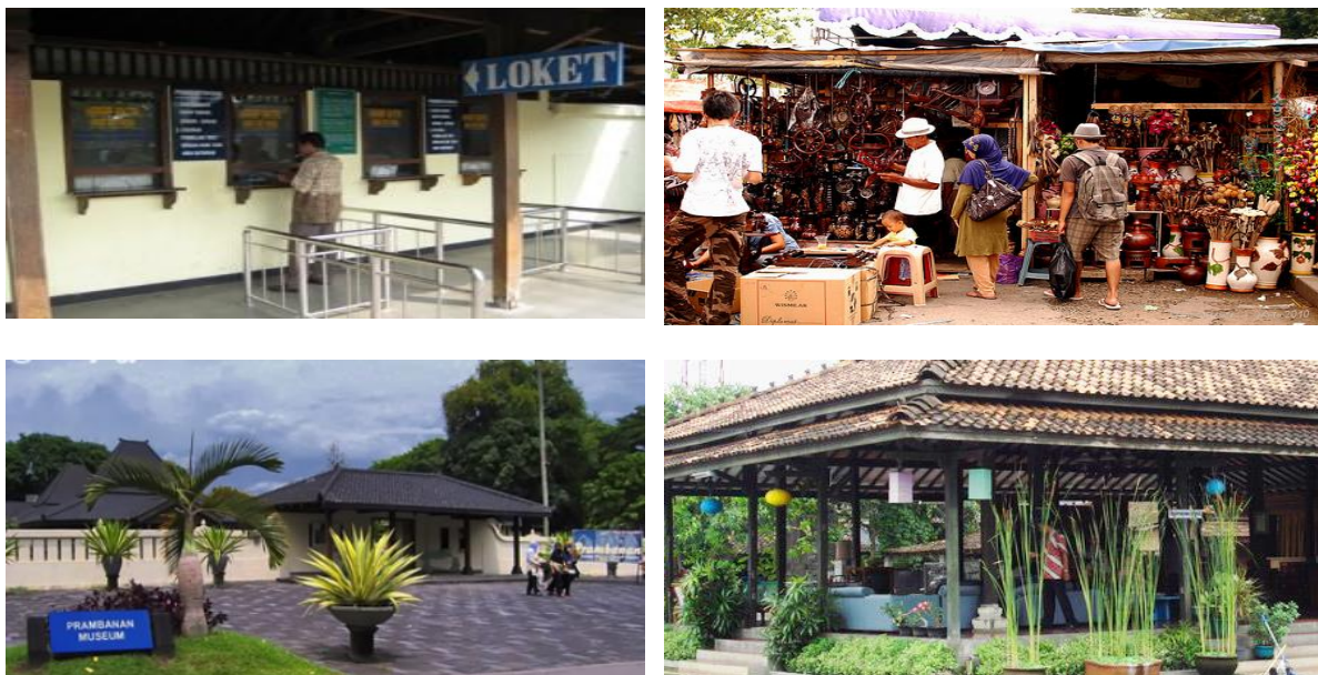
Figure 4. Tourism Facilities at Prambanan Temple

Prambanan Temple Tourism Park is jointly managed by BP3 DIY, BP3 Central Java, and Taman Wisata Candi Borobudur-Prambanan-Ratu Boko Corporation. Prambanan Temple Tourism Park is ready to be developed as a national and international tourist attraction related to the temple destination attractiveness. Furthermore, to spur tourism growth, the central government together with the regions have built and developed components and various infrastructure supporting facilities for tourism and structuring environmental conditions. These supporting destination facilities can be seen in the photos below. It includes a parking lot, ticket sales area, information center, museum and audio-visual hall, restaurants, and souvenir selling points.