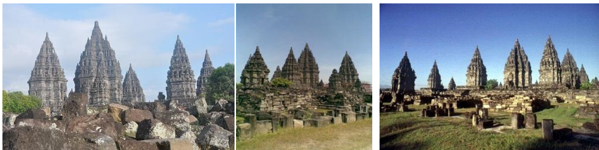
Figure 1. Shiva Prambanan Temple Sites: Before Restoration

In 1991, Prambanan Temple was designated by UNESCO as a world cultural heritage. This stipulation has implications for the protection and preservation efforts. As a world cultural heritage, the preservation of Prambanan Temple is not only the responsibility of the Indonesian people, but also the international community. Therefore, its preservation and utilization are monitored periodically by UNESCO through monitoring activities every five years. Currently, its preservation is still being carried out so that it can be used sustainably. Not all of the restoration activities that have been carried out can be carried out on the existing temple buildings. This is due to the stone components has been lost and stolen. However, all the temple buildings in the central courtyard have been completely restored and have become the main attraction in Prambanan Temple Park (Emeralda, 2015; Santiko, 2015).