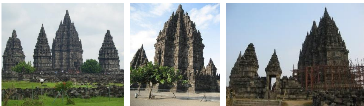
Figure 2. Shiva Prambanan Temple Sites: After Restoration