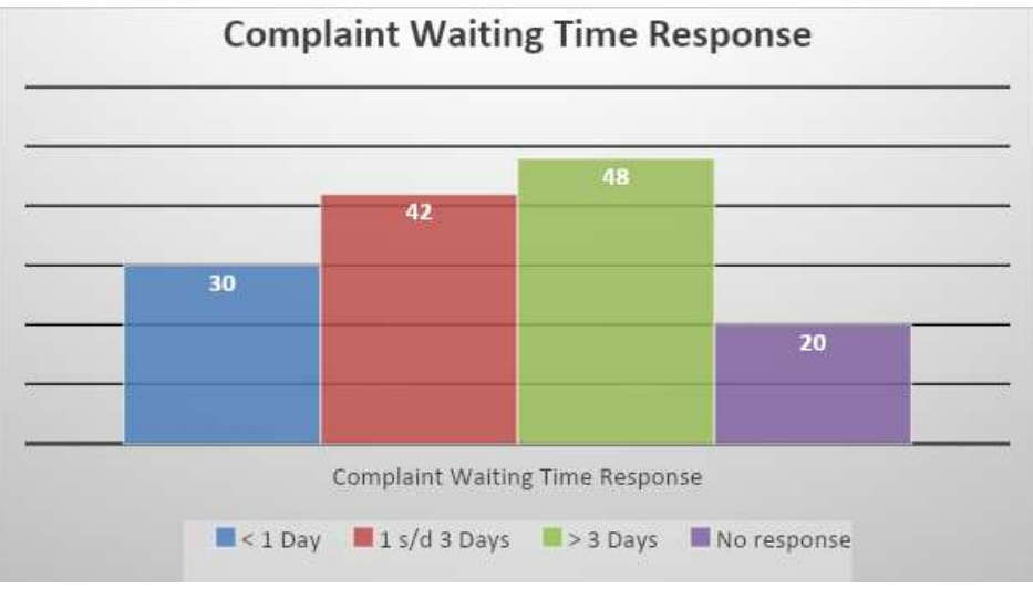
Figure 3. Complaint waiting time response

The next question posed was that the media used to convey the most complaints were Instagram, Twitter, other social media, company websites, WhatsApp and Facebook. The reason is that their consumers are more familiar and have many social media accounts, so they use it to submit complaints.