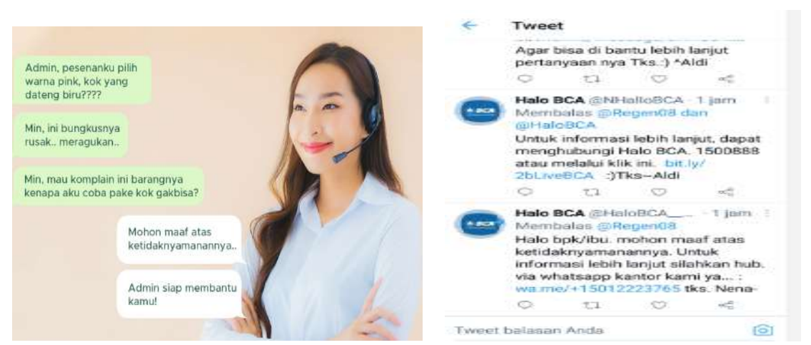
Figure 1. Example of a consumer complaint through social media

The number of complaints in e-commerce cannot be separated from the development of e-commerce (Purnama, 2011), including complaints from consumers in the e-commerce sector, but these complaints were successfully resolved. Cahyono (2016) said that in e-commerce, complaints involve cancellation of airplane tickets, refunds, and purchases of goods that are inappropriate or damaged. Complaints also cover cases where consumers do not receive goods, contractors cancel orders, goods do not arrive as promised, and e-commerce fraud is involved (Krui, 2022). According to Diamond (2015), the handling of consumer complaints can be considered complete if the consumer receives the results of the investigation and confirmation from the seller that the complaint has been resolved (Ransbotham, Lurie, & Hongju, 2019). After that, the complaint is considered complete when an agreement has been reached between the entrepreneur and the consumer and the complaint has been clarified, mediated, or directly resolved by the business actor (Ransbotham, Lurie, & Hongju, 2019).