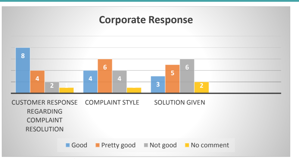
Figure 6. Company response to consumer complaints

The following questions were asked related to the company's response in resolving the complaint as follows: customer response regarding the complaint resolution stated well, the use of the complaining language style was quite good and the solutions provided were not good (Figure 6). These results show that there are still solutions provided by consumers that do not provide satisfaction for consumers.