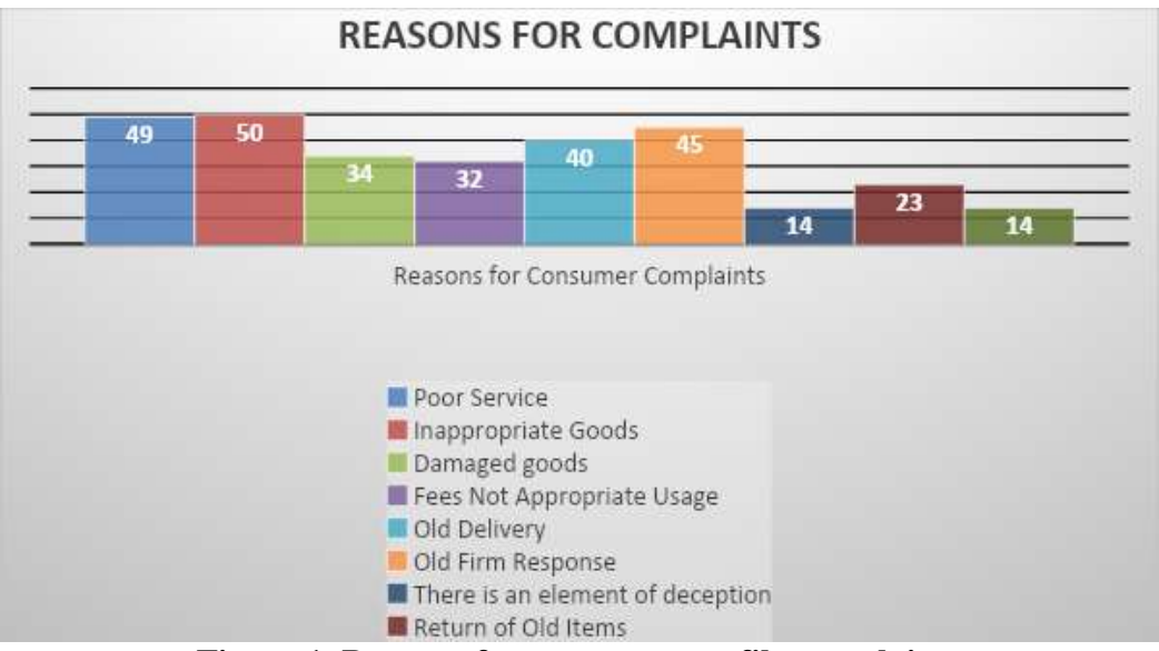
Figure 1. Reasons for consumers to file complaints

From the results of open and in-depth interviews with consumer informants, the following information can be obtained: