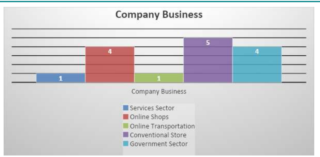
Figure 4. Company business

As a counterweight, questions are asked of organizations that provide services to consumers and those who interact with buying and selling. The results include five conventional stores, four online stores, the public service sector (government), and one company each in the service sector and online transportation.